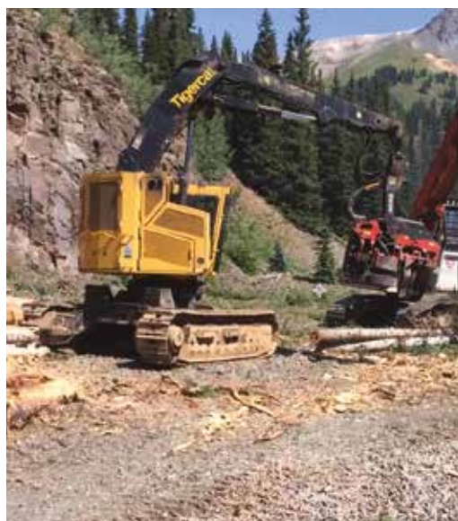
Above Highway 550, a timber loader and a logging processor turn felled trees into lumber.

When our Board of Directors called out "Fire Mitigation" as one of the most specific phrases in our current Strategic Objectives, it was no accident. We thank our members for enduring inconveniences as we work to keep our territory safe.