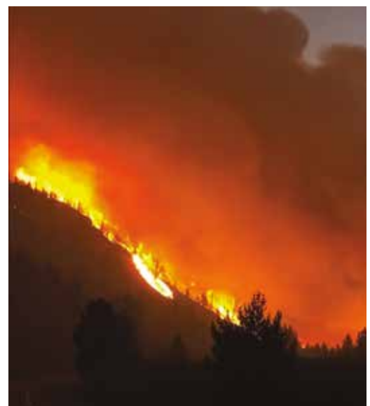
Troublesome Fire, Near Granby, Colorado 2020